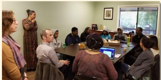
CCI staff visit the Marin City Academy of Health & Wellness H.S.

We thank the Center for Care Innovation’s i-Lab, the Schow Foundation, and other donors who helped launch this innovative approach to educational equity. To learn more or to support this program, contact zared@marincityclinic.org .